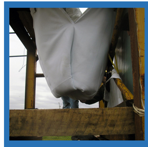
The felt tube was secured to a frame over the hole (top) prior to inversion (bottom).