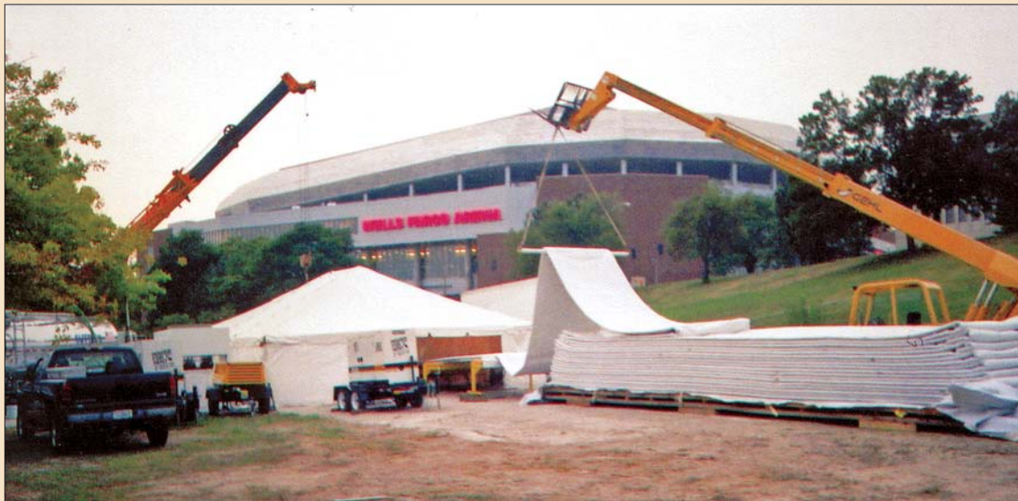
Large diameter felt tubing was readied for wet-out near the busy Wells Fargo Arena.

Sections of brick-lined sewers under downtown Des Moines, Iowa, were installed in the late 1800s. So when city engineers decided to upgrade the sewers in 2004 and 2005, the 19th century pipelines leaped into the 21st century with new thermoset liners, installed by Visu-Sewer Clean & Seal Inc., Pewaukee, Wis.