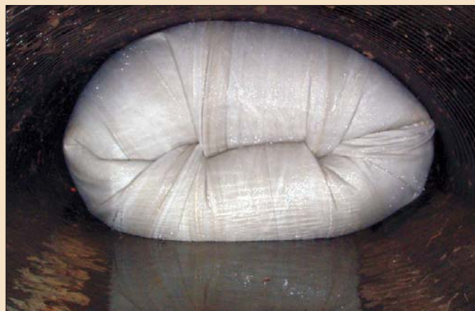
Pressure inverts the resin-impregnated felt tube through the host pipe.

For both the sharp turns and steep grades, close attention was paid to adjusting the head pressure as the liner was inverted. If pressure got too low, the liner would not be adequately applied against the host pipe surface. If the pressure got too high, the liner could burst at the seam.