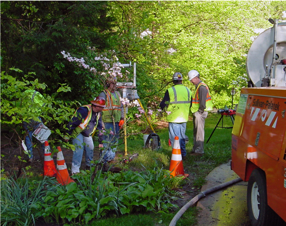
Insituform crews minimized disruption by using existing manholes for CIPP liner insertions.

created by the rehabilitated line also opens the way for the expansion of local business and commerce. a workday without the need for costly sewer flow by-passes. The work included a line that runs under Illinois Road, a major thoroughfare with an average daily traffic rating of 32,000. Trenches would have closed the road for approximately two months.