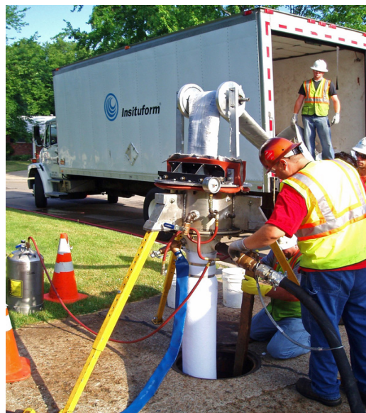
Resin-impregnated liners were shipped under controlled conditions to designated installation points.