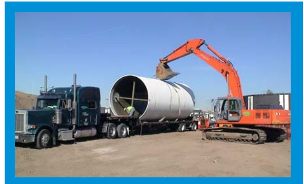
Lightweight composite pipe is easily moved with less expensive equipment.