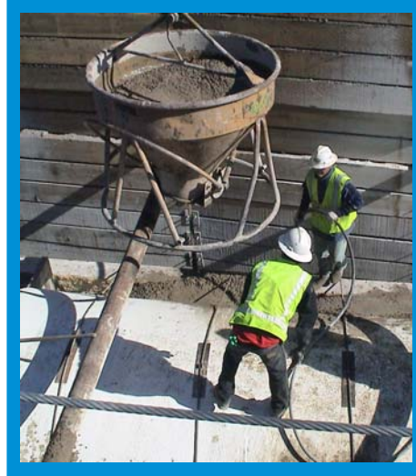
Concrete grout was poured in the space between the pipe and trench wall.

Composite pipe designed by Belco specifically for the project offered the best solution for speed of installation. The custom pipe fit precisely into the U-shaped channel which served as a trench. A concrete grout was injected between the trench inner wall and pipe outer wall. Cables held the pipe in place to keep the pipe from getting buoyant in the wet grout before it cured.