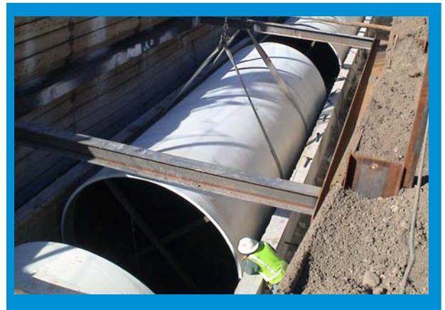
The 28-foot pipe sections were lowered through a 29-foot wide "window" then rolled into place.

An ingenious combination of old concrete and new fiber-reinforced polymer (FRP) composite saved precious time while preventing a potentially serious wastewater problem in metropolitan Denver.