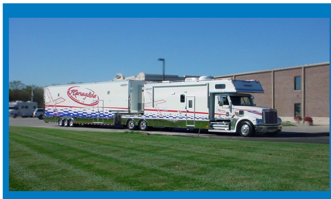
Fiber-Tech is a leading manufacturer of composite panels for transportation applications.

“The resins and gel coats have been very high quality and very consistent,” Pfeifer says. “Since we began using the AOC products, we’ve made very few process changes.”