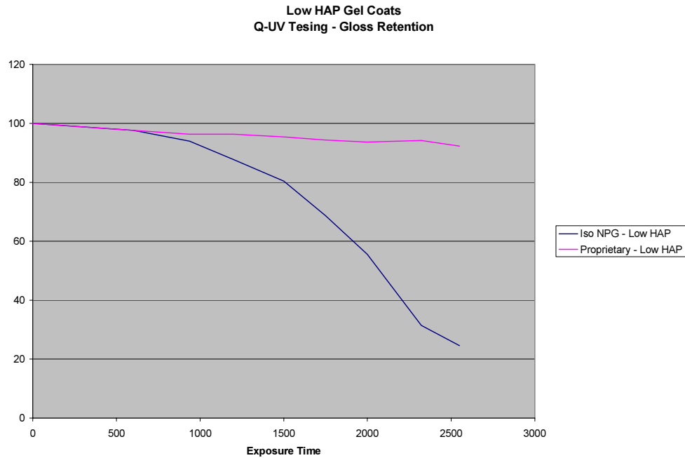
Figure - 7